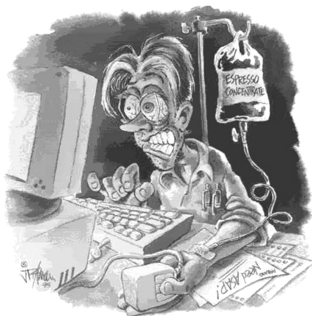
Transit Miami, June 27, 2007

A survey issued by the Center for the New American Dream found that half of all Americans with full-time jobs would prefer to work a four-day week at 80% of their current pay.